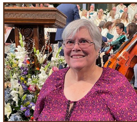
Ronda Rogers By Letter