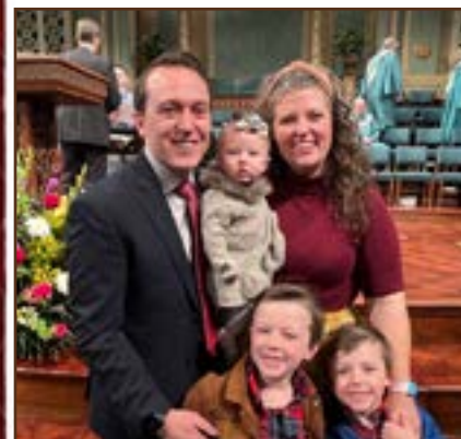
Birdie Dot Bulla